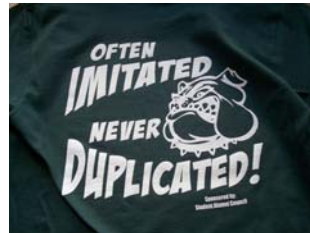
Front Back Experience T