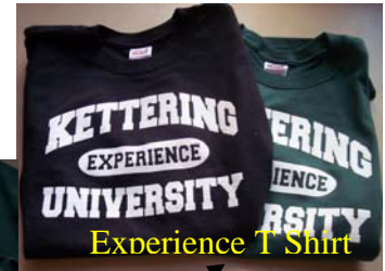
Experience T Shirt