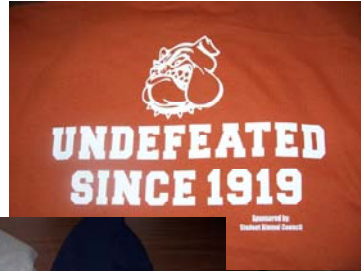
Example of back of Hooded Sweatshirt and T-shirts